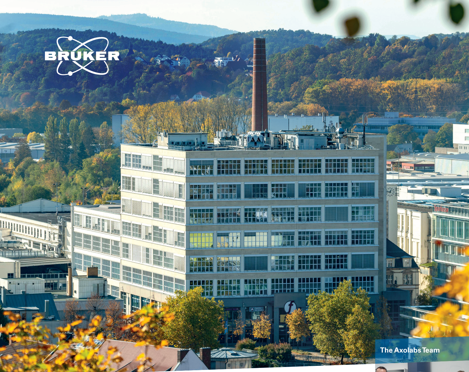
The Axolabs Team